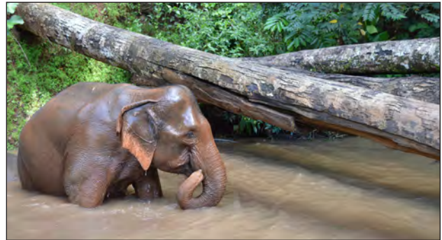
Tourists watch as an elephant rescued by the Elephant Valley Project in Cambodia bathes.

Using a common theory of change across projects for supporting conservation enterprises (as in BCN) provides the comparative framework for assessing the soundness of assumptions across projects will help inform what works, what doesn’t, and under what conditions.