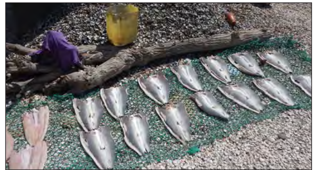
Fishermen dry the day's catch in the sun along Senegal's coast.